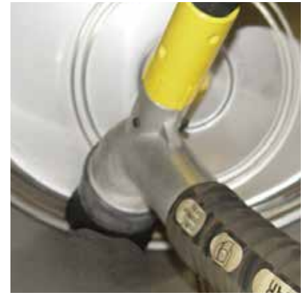
Sandblasting head for working on inside edges.