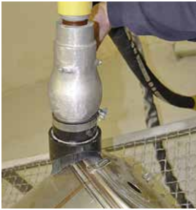
Sandblasting of Inox weld on outside edge.