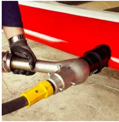
Sandblasting head for working on outside edges.