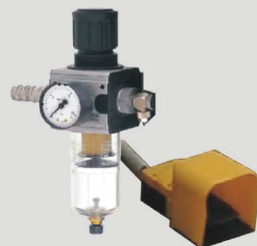
Foot pedal with filter and pressure regulator