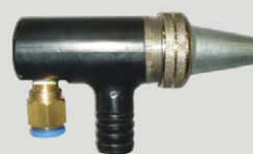
Injector blast gun type INJ 1 K