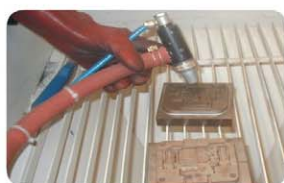
Delicate cleaning with injector blast gun