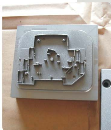
Our technology is suitable for demanding users and is based on the newest laser technics