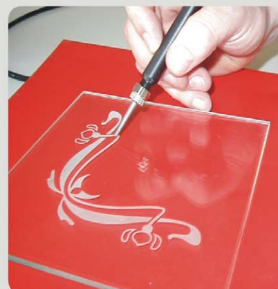
Microblasting with MINIBLAST (optional)