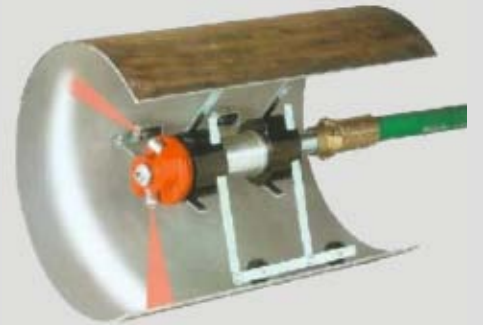
Notranje peskanje cevi-SLO-V2.0.cdr