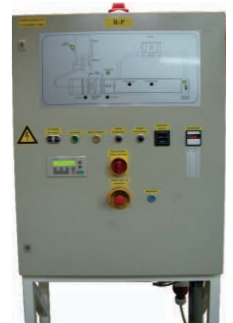
Computerized electro-control board