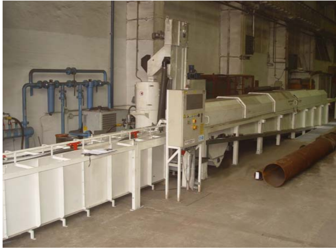
Inblast 200/640 - 12