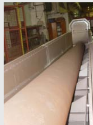
Tube \varnothing 480mm, 12m