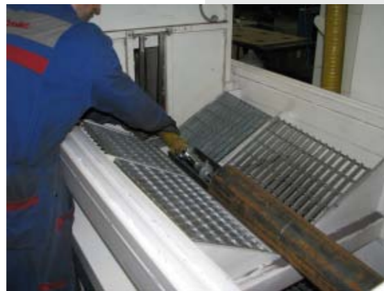
Start-point with centering ring