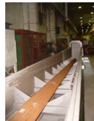
Tube \varnothing 250mm, 12m