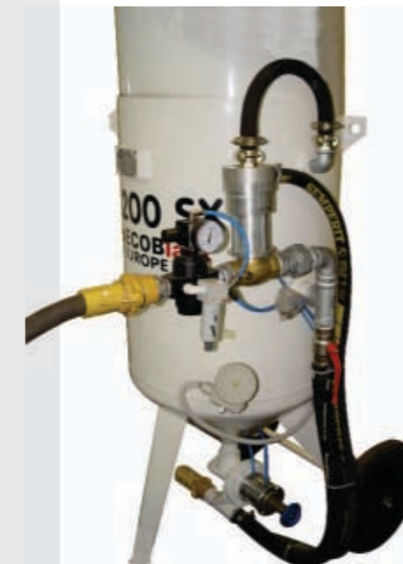
Pressure blast machine TZP 200 SX with level indicator