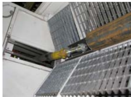
HB 360 degree blasting nozzle