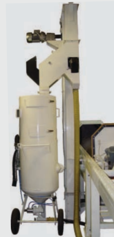
Abrasive recovery system