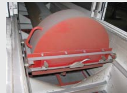
End point of the machine with a movable protective wall