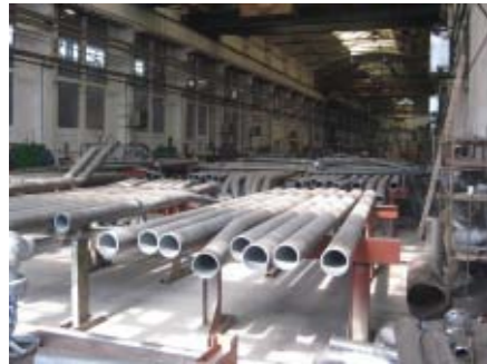
The innovative construction of our machine enables sandblasting of slightly curved tubes.