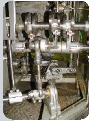
DRY ICE CLEANING