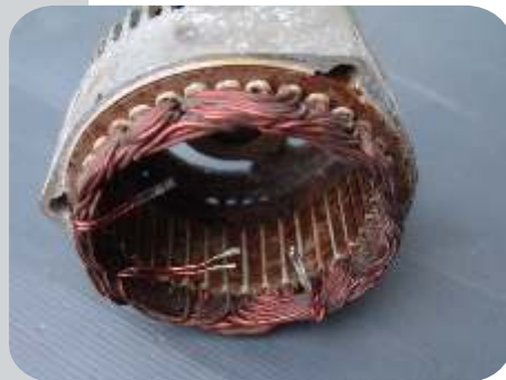
CLASSICAL SANDBLASTING WITH SPECIAL ABRASIVES