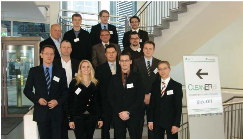
Figure 2: Members of the project team on CleanER initial meeting in Bayreuth

In January, the first meeting of the CleanER project was held and the members of the working groups set priorities, which will guarantee a successful realization of set goals. The project will be fully completed in 2013, but the most impatient users can expect first useful results in the form of verified solutions already by the end of this year.