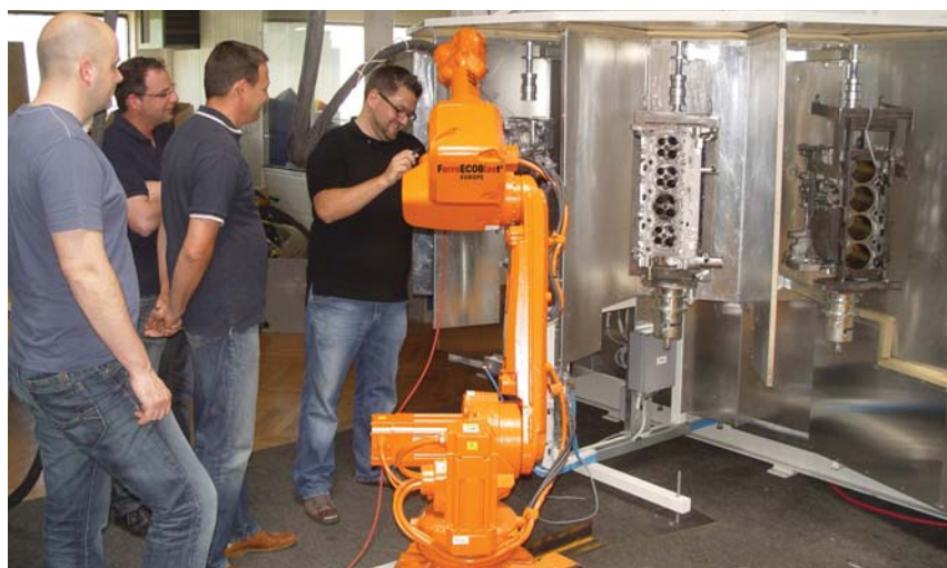
Figure 4: Final parameters settings and testing on parts of the customer

engine components, removing plaque and cleaning the gaskets will be reduced to approximately one fourth of the time that was needed with manual cleaning. It is through the introduction of this treatment cell, the company will provide the basic requirement for increasing the capacity of remanufacturing of engine, which is of strategic importance for the further development and strengthening the position of the European and global industrial reconstruction engine provider.